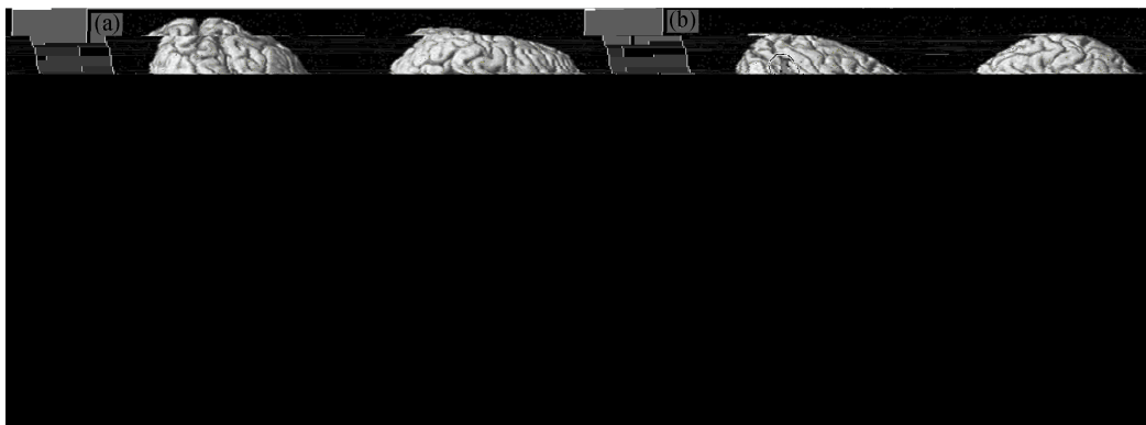
Fig. 2. Activation increases associated with global/local processing. (a) Illustration of brain areas involved in global and l

a) **, p < 0.001 (uncorrected); *, p < 0.005 (uncorrected); Voxels, no. = number of voxels in a cluster.